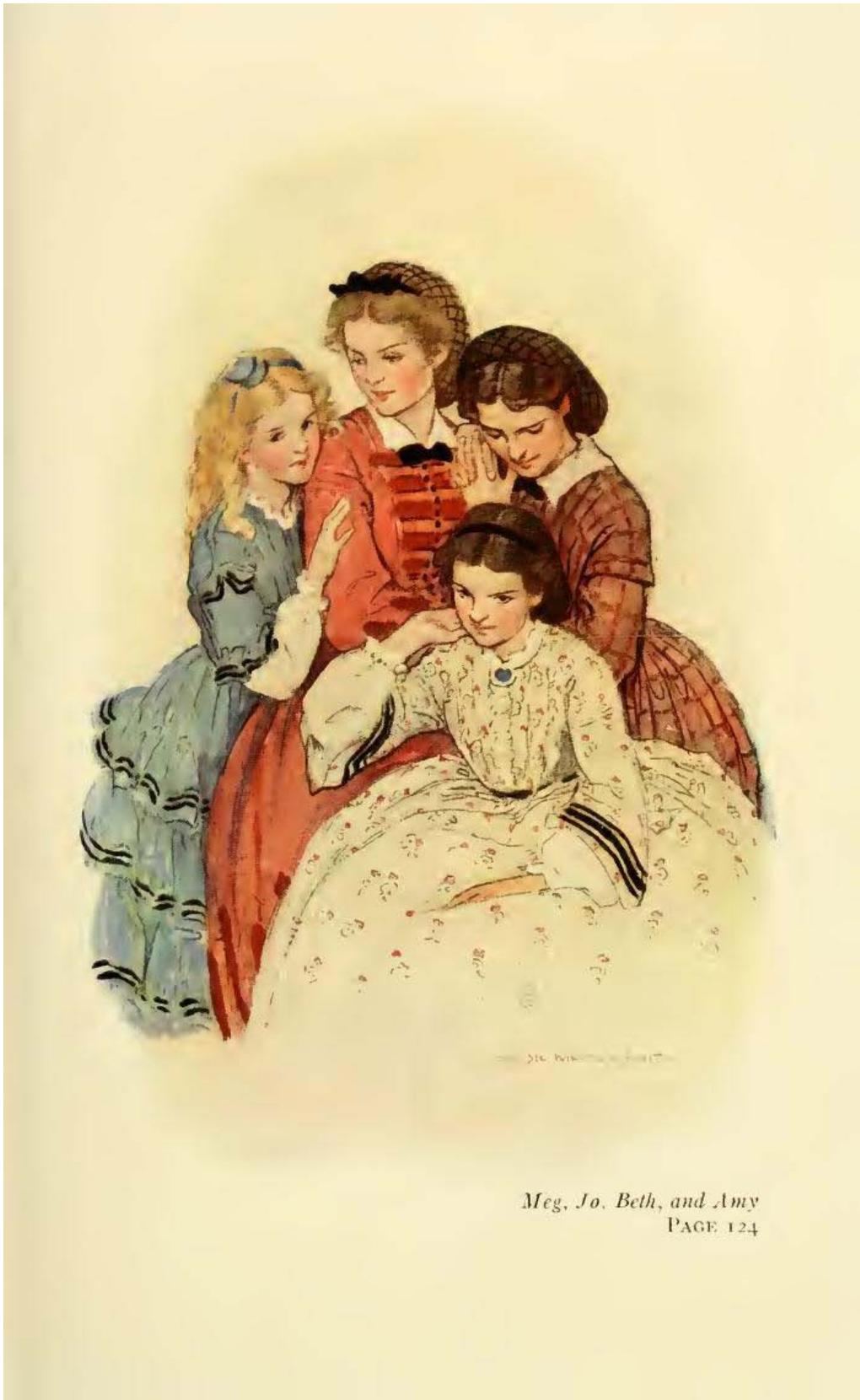
Meg, Jo, Beth, and Amy PAGE 124