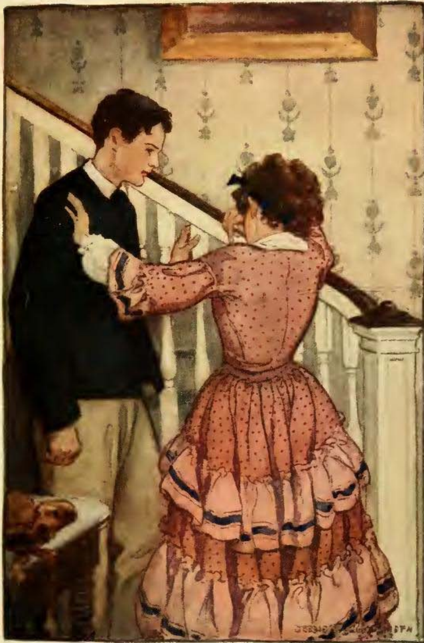
Holding on to the banisters, she put him gently away PAGE 232