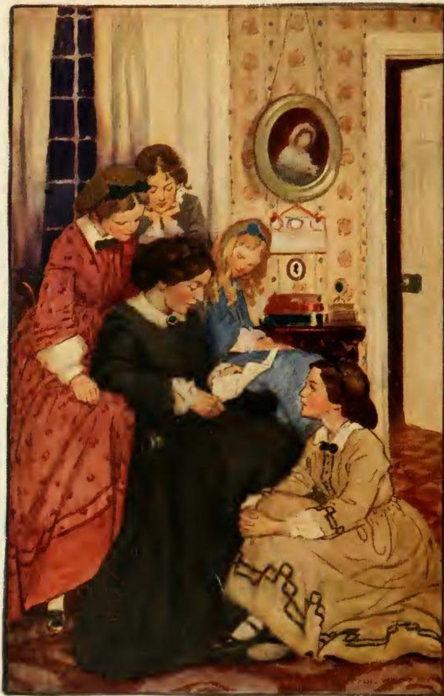
They all drew to the fire FRONTISPIECE