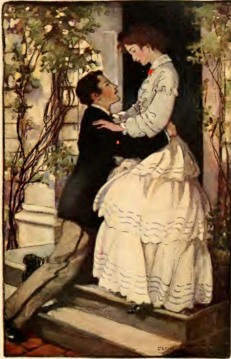
He put his arms about her, as she stood on the step above him