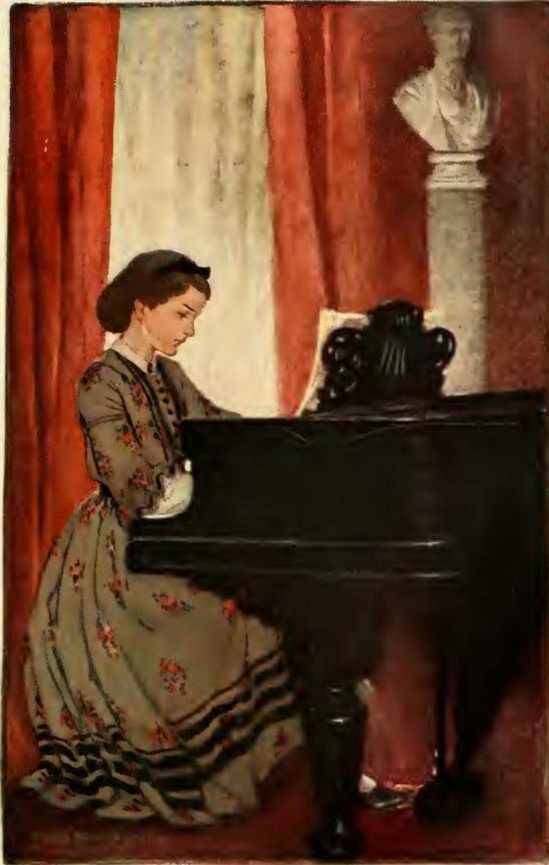
The great drawing-room was haunted by a tuneful spirit that came and went unscen PAGE 76

Laurie's help, got them smuggled onto the study table one morning before the old gentleman was up.