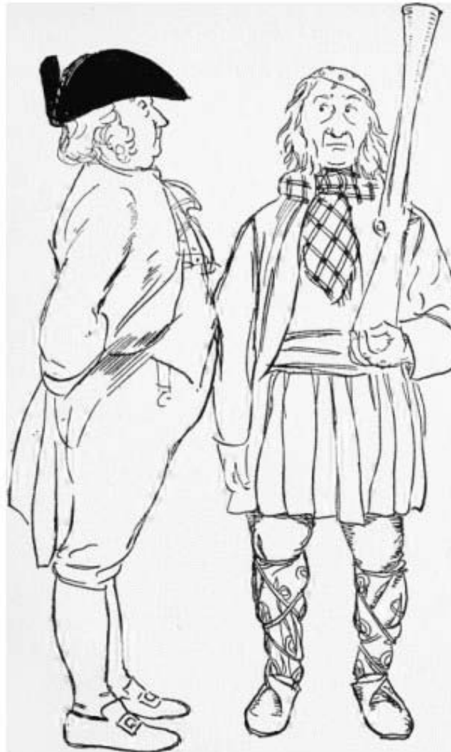
Standing Sentry Over Him

"Now, Mayor," said the captain, "choose. Help me to my Bride, or be bombarded."