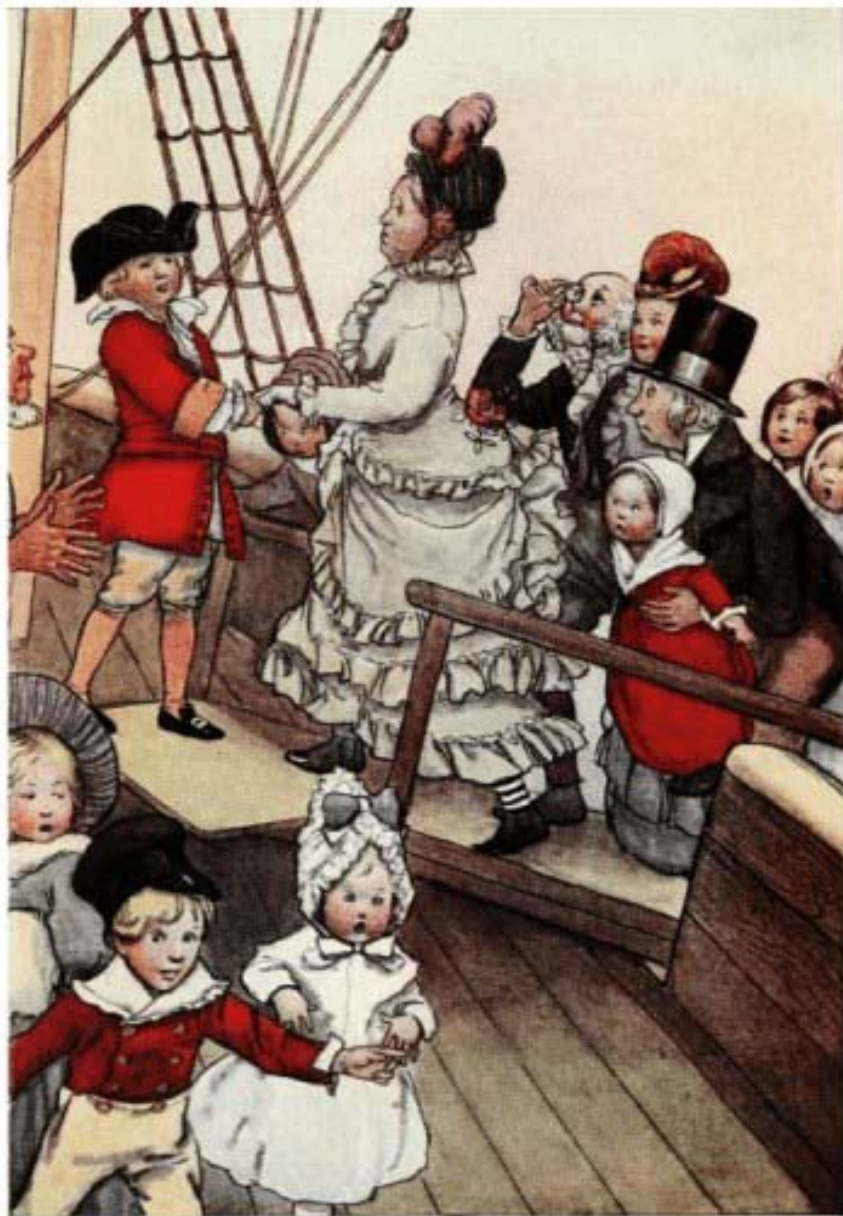
"Invited them to Breakfast"