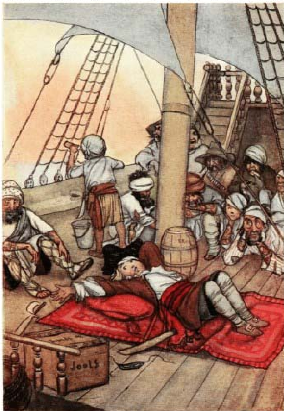
"His crew lay grouped around him"