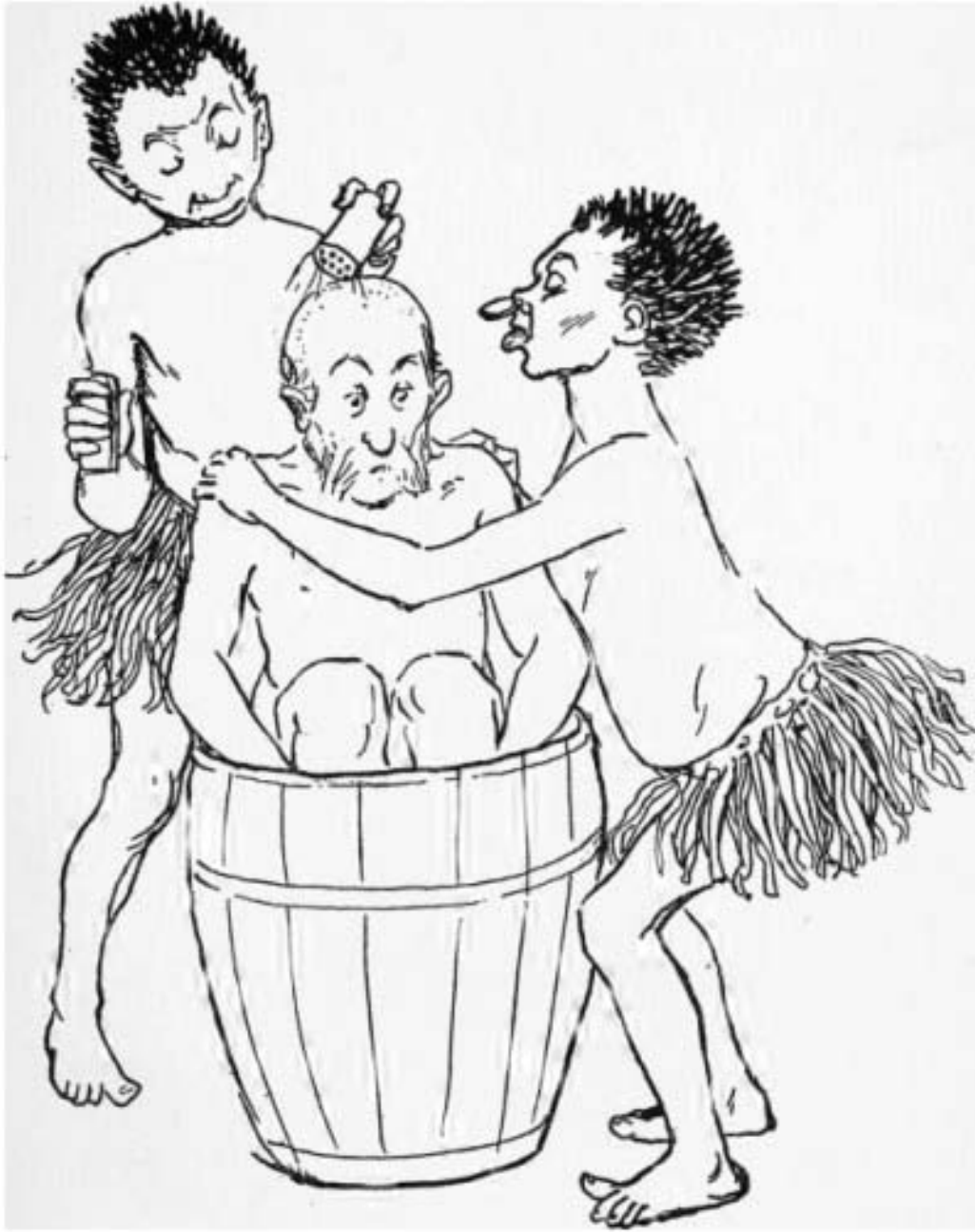
"Two Savages Floured Him Before Putting Him To The Fire."

Boldheart now took counsel with his officers on the course to be adopted. In the mean time, the miserable captive never ceased begging pardon and imploring to be delivered. On the generous Boldheart's proposal, it was at length resolved that he should not be cooked, but should be allowed to remain raw, on two conditions. Namely,