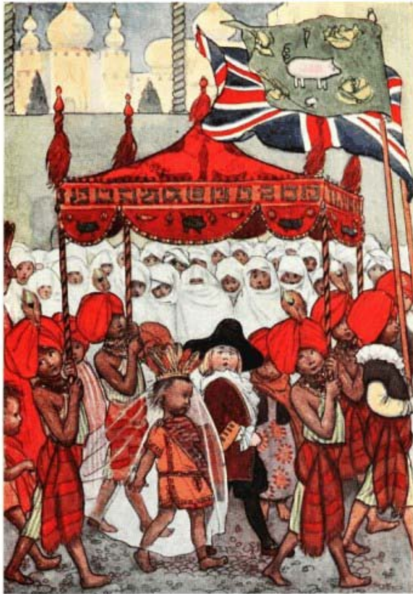
"Married the Chief's daughter"

she ran up a flag, which he instantly recognized as the flag from the mast in the back-garden at home.