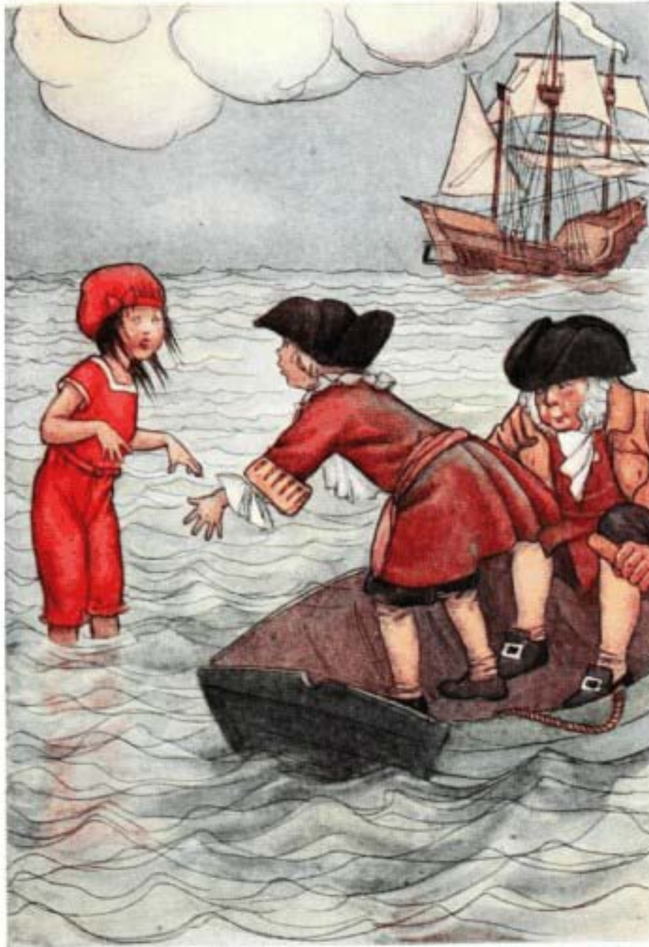
"His lovely Bride came forth"

Only one thing further happened before the good ship Family was dismissed, with rich presents to all on board. It is painful to record (but