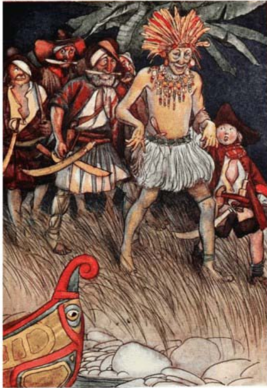
"Arm-in-arm with the Chief"

Choo a choo a choo tooth. Muntch, muntch. Nycey! Choo a choo a choo tooth.Muntch, muntch. Nyce!