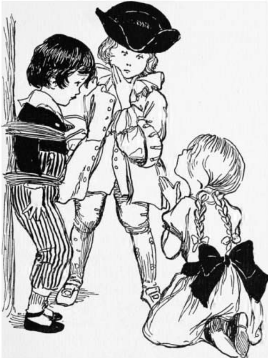
"Captain Boldheart's Lady Begged For Him And He Was Spared."

such is human nature in some cousins) that Captain Boldheart's unmannerly cousin Tom was actually tied up to receive three dozen with a rope's end "for cheekyness and making games," when Captain Boldheart's lady begged for him and he was spared. The Beauty then refitted, and the Captain and his Bride departed for the Indian Ocean to enjoy themselves for evermore.