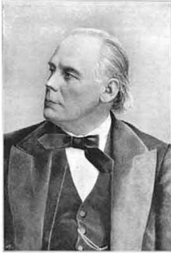
CHARLES BRADLAUGH M.P.

"He is the finest speaker of Saxon-English that I have ever heard," she answered, "except, perhaps, John Bright, and his power over a crowd is something marvellous. Whether you agree with him or not, you should hear him."