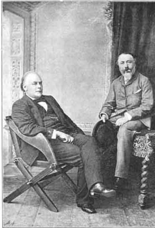
CHARLES BRADLAUGH AND HENRY LABOUCHERE

The outburst of anger from the more bigoted of the Christian community was as savage as the outburst of delight had been exultant, but we recked little of it. Was he not member, duly elected, without possibility of assailment in his legal right? Parliament was to meet on April 29th, the swearing-in beginning on the following day, and Mr. Bradlaugh had taken counsel with some other Freethinking members as to the right of Freethinkers to affirm. He held that under the Act 29 and 30 Vict. c. 19, and the Evidence Amendment Acts 1869 and 1870, the right to substitute affirmation for oath was clear; he was willing to take the oath as a necessary form if obligatory, but, believing it to be optional, he preferred affirmation. On May 3rd he presented himself and, according to the evidence of Sir Erskine May, the Clerk of the House, given before the second Select Committee on his case, he "came to the table and delivered the following statement in writing to the Clerk: 'To the Right Honourable the Speaker of the House of Commons. I, the undersigned, Charles Bradlaugh, beg