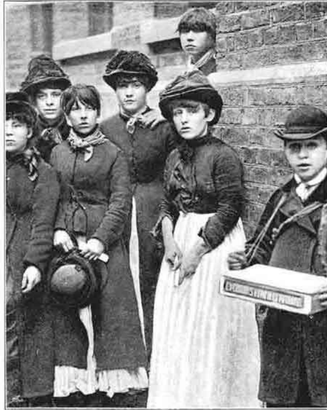
MEMBERS OF THE MATCHMAKERS' UNION.

Not only so; but since 1886 there had been slowly growing up a conviction that my philosophy was not sufficient; that life and mind were other than, more than, I had dreamed. Psychology was advancing with rapid strides; hypnotic experiments were revealing unlooked-for complexities in human consciousness, strange riddles of multiplex personalities, and, most startling of all, vivid intensities of mental action when the brain, that should be the generator of thought, was reduced to a comatose state. Fact after fact came hurtling in upon me, demanding explanation I was incompetent to give. I studied the obscurer sides of consciousness, dreams, hallucinations, illusions, insanity. Into the darkness shot a ray of light—A.P. Sinnett's "Occult World," with its wonderfully suggestive letters, expounding not the supernatural but a nature under law, wider than I had dared to conceive. I added Spiritualism to my studies, experimenting privately, finding the phenomena indubitable, but the spiritualistic explanation of them