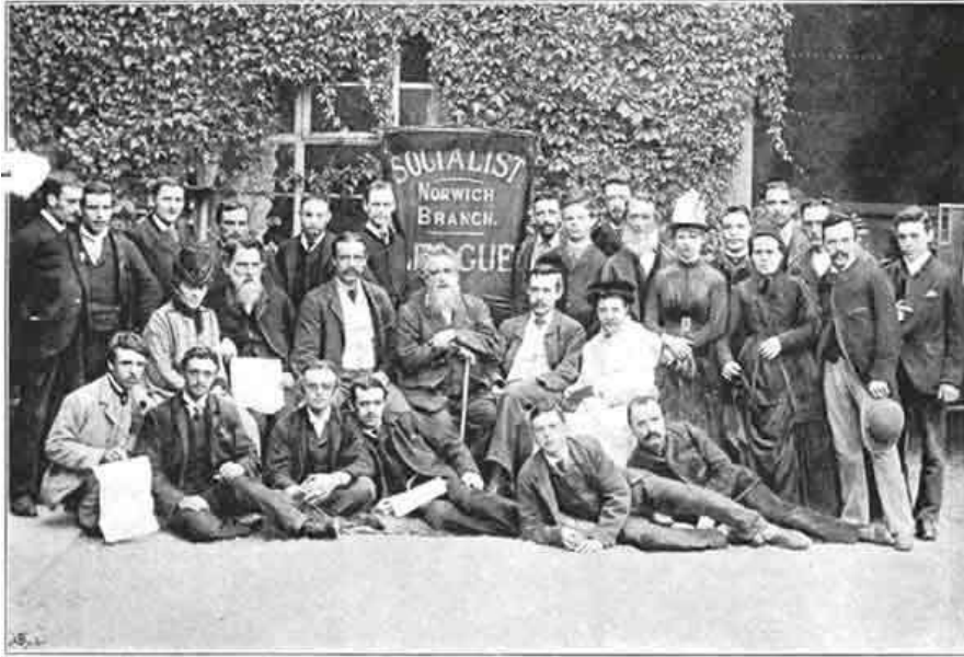
NORWICH BRANCH OF THE SOCIALIST LEAGUE

and to his country, but he did not live long enough to render to England all the services which his long training, his wide knowledge, his courage, and his honesty so eminently fitted him to yield.