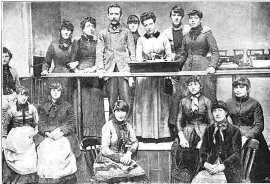
STRIKE COMMITTEE OF THE MATCHMAKERS' UNION.

The worst suffering of all was among the box-makers, thrown out of work by the strike, and they were hard to reach. Twopence-farthing per gross of boxes, and buy your own string and paste, is not wealth, but when the work went more rapid starvation came. Oh, those trudges through the lanes and alleys round Bethnal Green Junction late at night, when our day's work was over; children lying about on shavings, rags, anything; famine looking out of baby faces, out of women's eyes, out of the tremulous hands of men. Heart grew sick and eyes dim, and ever louder sounded the question, "Where is the cure for sorrow, what the way of rescue for the world?"