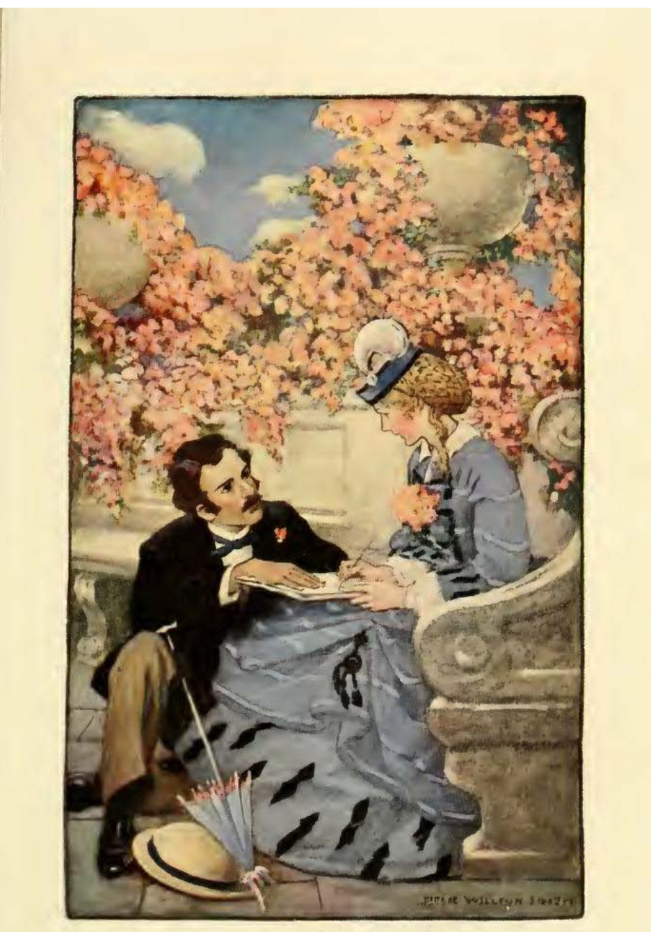
In a minute a hand came down over the page, so that she could not draw PAGE 514

ring nestled down into the grass, as if to hide something too precious or too tender to be spoken of.