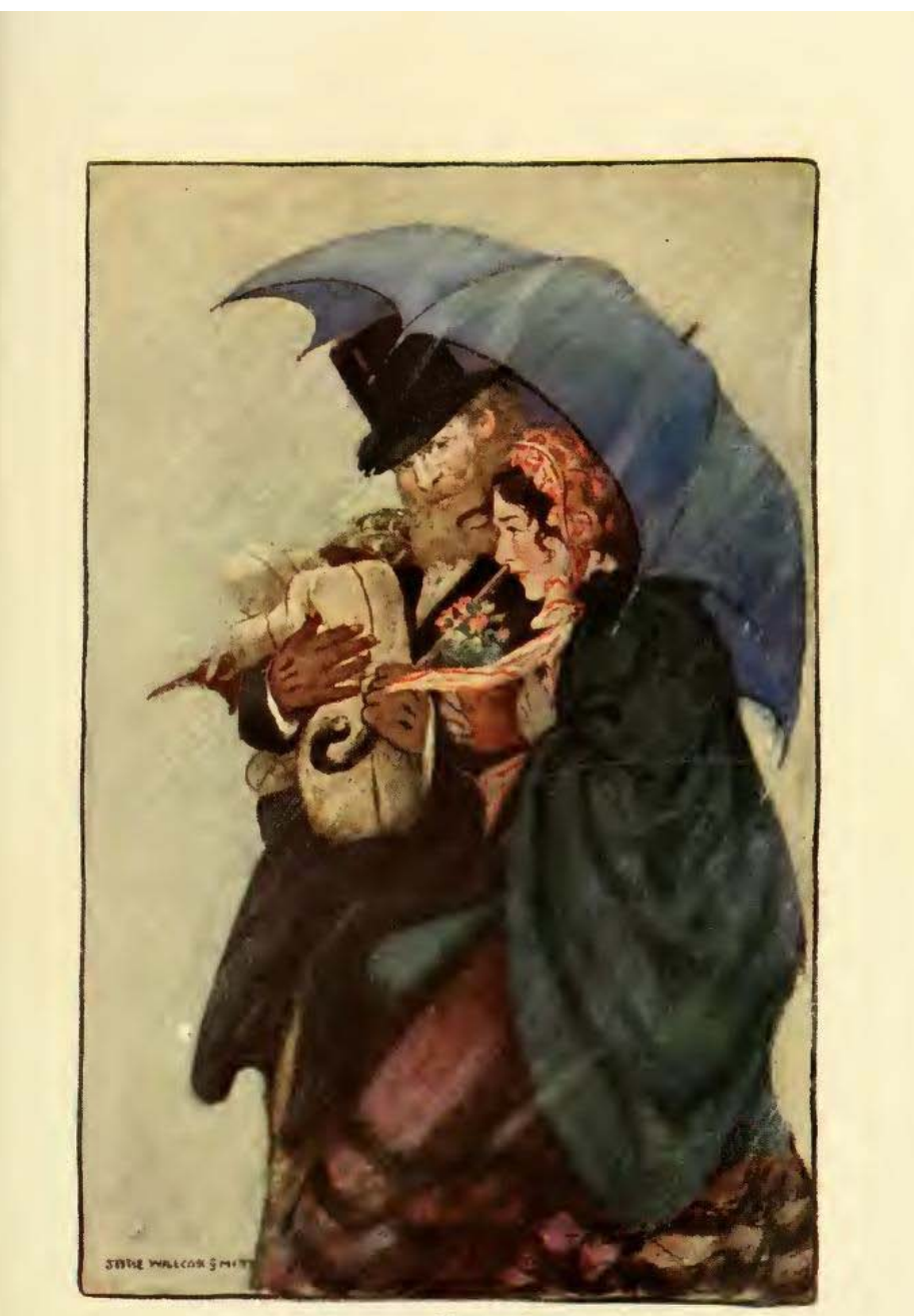
Passers-by probably thought them a pair of harmless lunatics PAGE 597

discovered that her feet were cold, her head ached, and that her heart was colder than the former, fuller of pain than the latter.