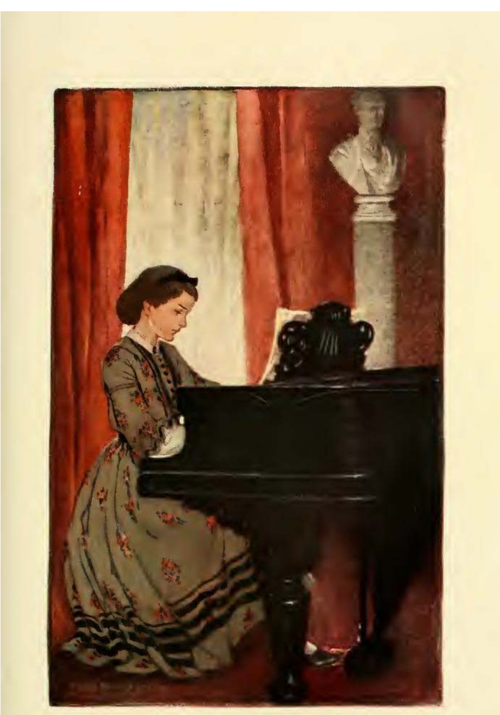
The great drawing-room was haunted by a tuneful spirit that came and went unseen PAGE 76

Laurie's help, got them smuggled onto the study table one morning before the old gentleman was up.